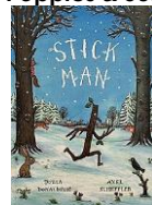
Stick Man by Julia Donaldson