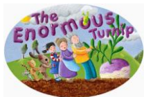
The Enormous Turnip – a traditional story

https://www.youtube.com/watch?v=rYulNlGW1A Link to watch Rosie's Walk