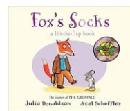
Fox's Socks by Julia Donaldson